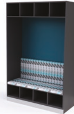
Team Seating Booth