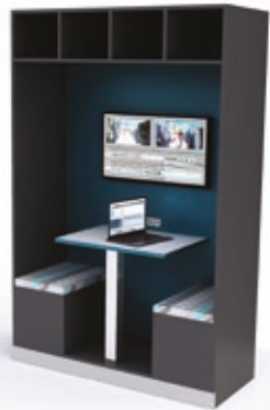
Team Study Booth