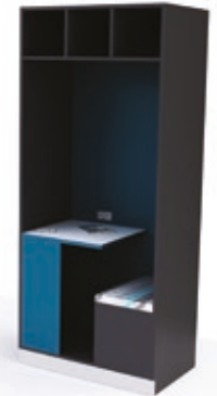
Individual Study Booth